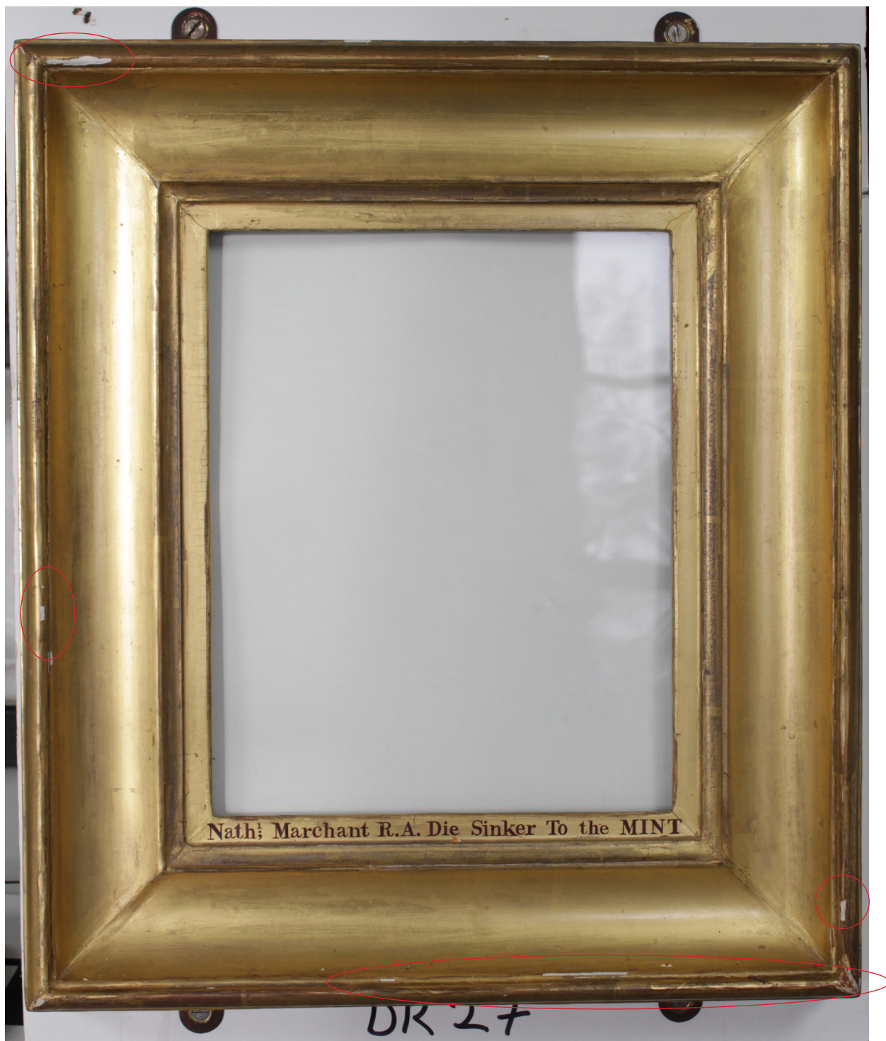
IMAGE OF OBJECT/FRAMED WORK PRIOR TO TREATMENT FOR ANNOTATION (Front/recto)