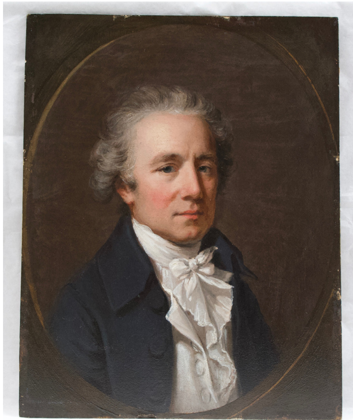
IMAGE OF OBJECT/FRAMED WORK PRIOR TO TREATMENT FOR ANNOTATION